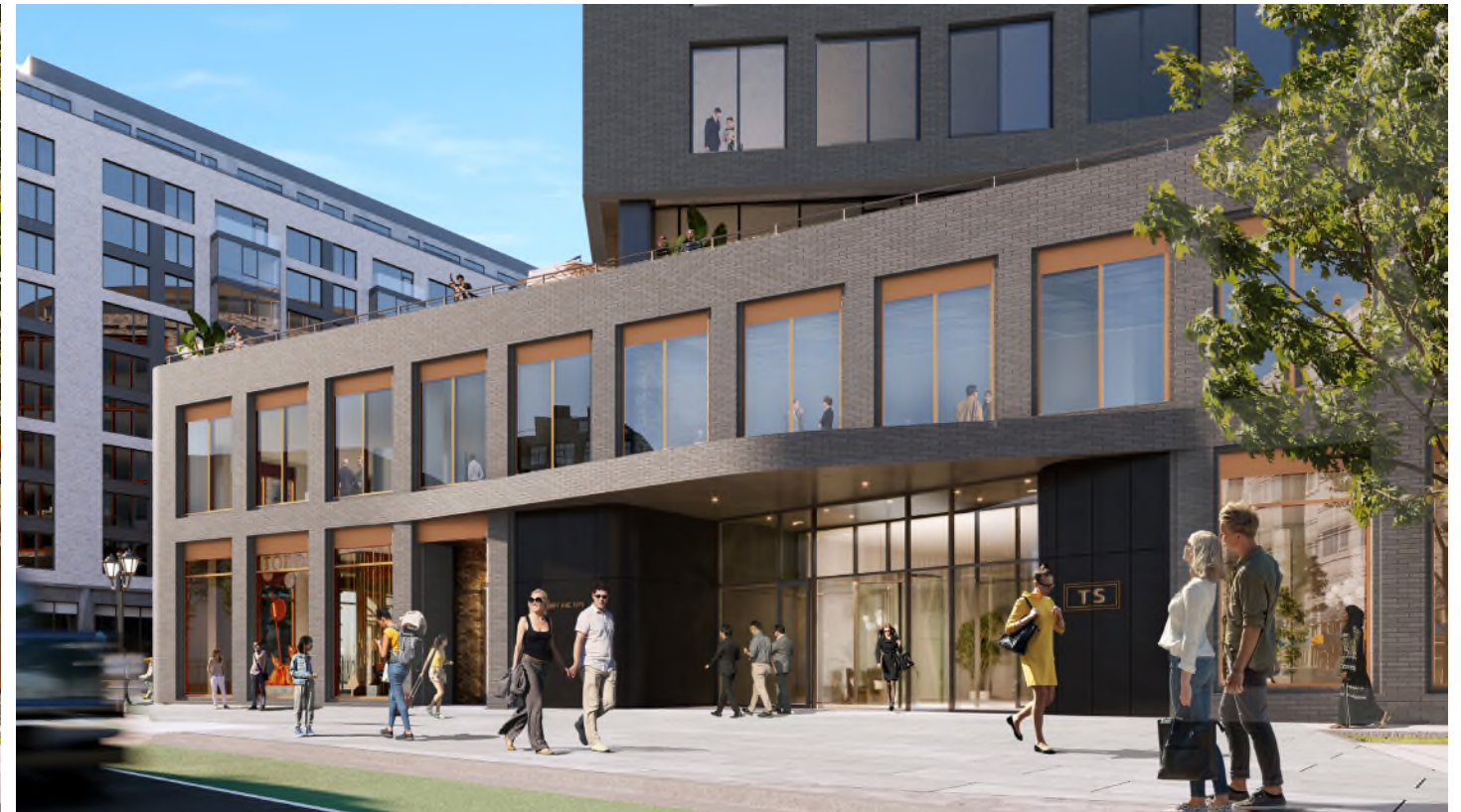
REVISED SUBMISSION - MAY 30TH, 2019