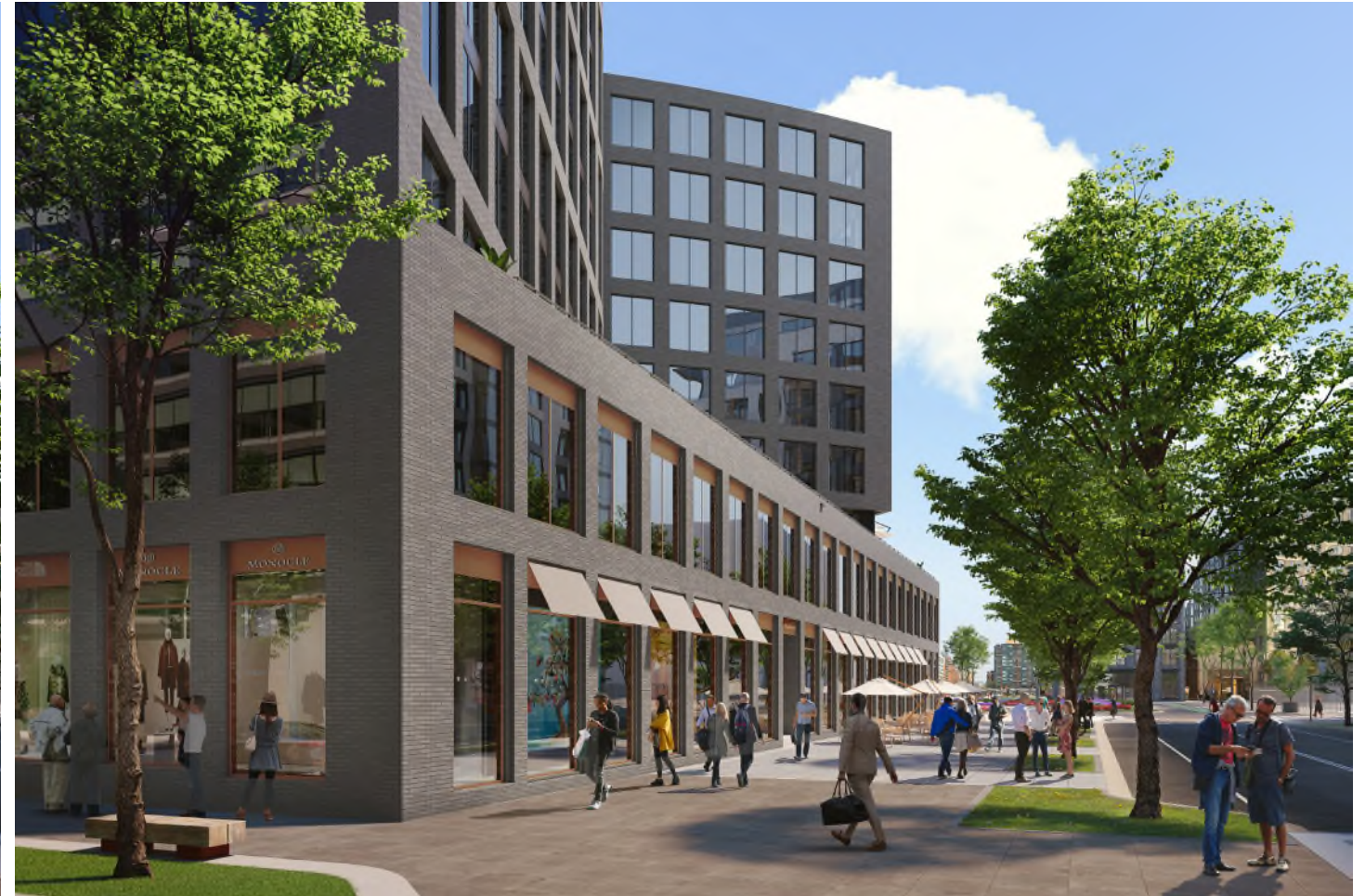
ZONING COMMISSION HEARING - MAY 23RD, 2019