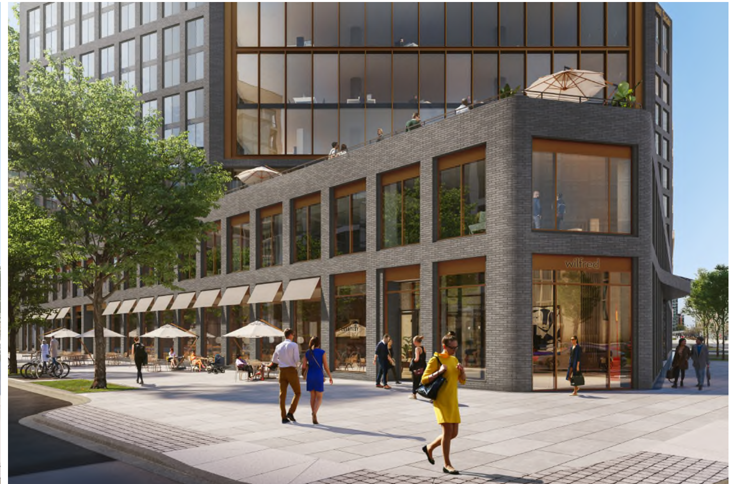
ZONING COMMISSION HEARING - MAY 23RD, 2019