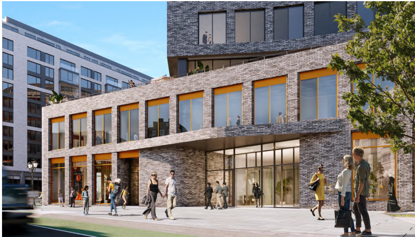
ZONING COMMISSION HEARING - MAY 23RD, 2019